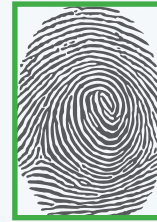
MSO 1300 Series Capture