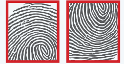
Placement variations on smaller sensors

MSO 1300 Series capture surface (14x22mm) ensures that the richest area on fingerprints is systematically captured time after time. Acquisition surface area contributes significantly to the overall biometric performance: