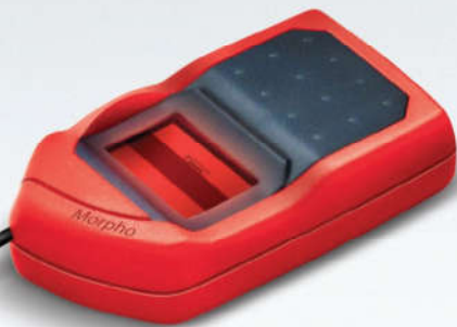
MSO 1300 V3 / MSO 1300 E3

The MorphoSmart™ 1300 Series offers a reliable, ergonomic and cost-effective solution for enrollment, identity verification and user identification. Their match-on-device or match-on-card functions guarantee the faultless protection of information and the security of desktop applications.