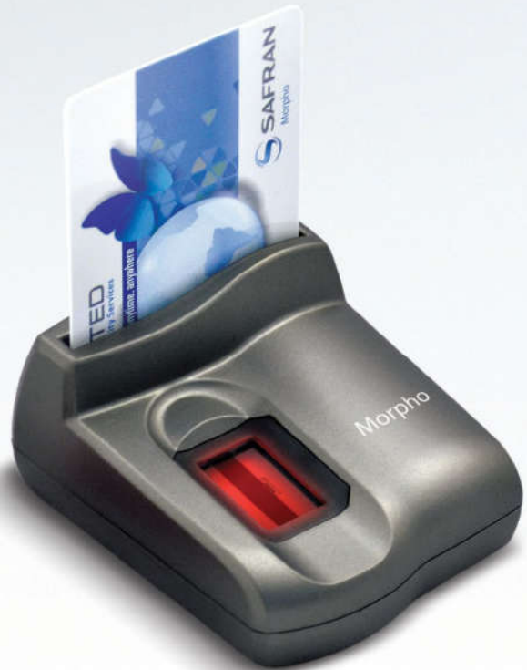
MSO 1350 V3 / MSO 1350 E3